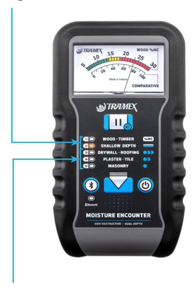
Scales 3, 4 and 5 have a preset sensitivity appropriate to the density of the materials indicated.

Scales 1 and 2, when used with wood, will give a %MC reading.